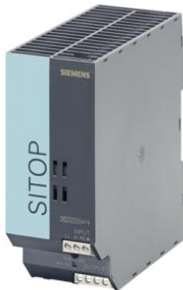
SITOP SMART 120 W STABILIZED POWER SUPPLY INPUT: 120/230 V AC OUTPUT: 24 V DC/5 A